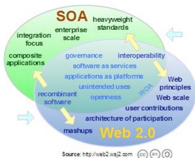
Figure 2: Web 2.0 and SOA